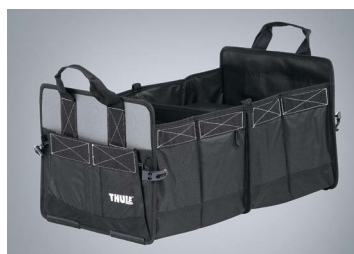
THULE GO BOX