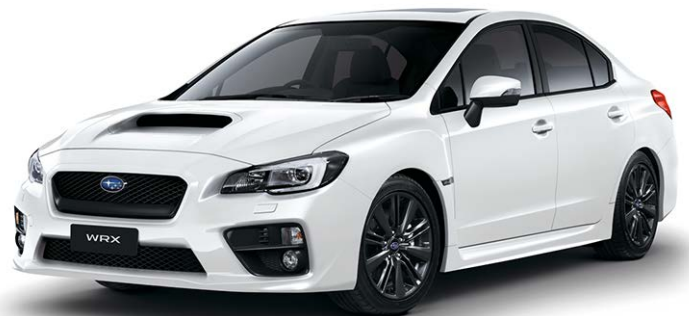
CRYSTAL WHITE PEARL