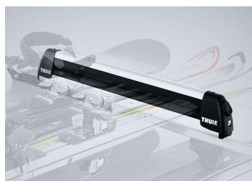
UNIVERSAL LOCKING ARMS 1