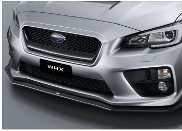
FRONT LIP SPOILER