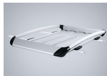
LUGGAGE RACK 1 (SMALL)