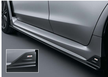
SIDE UNDER SPOILER