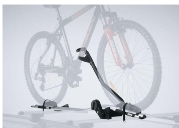
BICYCLE HOLDER 1 (UPRIGHT)