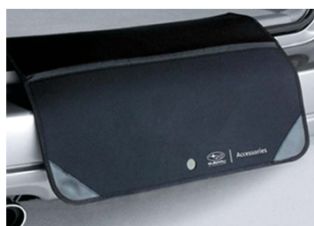
BOOT LIP AND BUMPER PROTECTOR