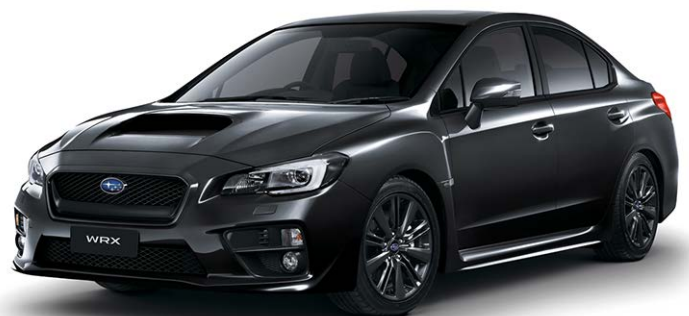
CRYSTAL BLACK SILICA