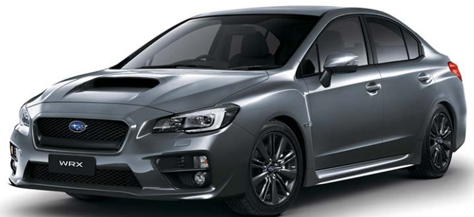
DARK GREY METALLIC