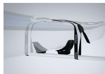
WATERCRAFT HOLDER 1