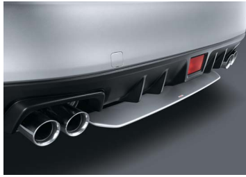
REAR UNDER SPOILER