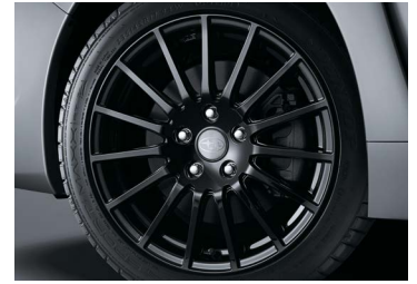
17-INCH ALLOY WHEELS