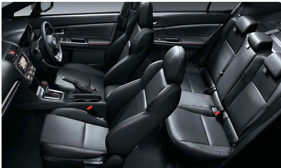
BLACK LEATHER 1 : SUBARU WRX PREMIUM