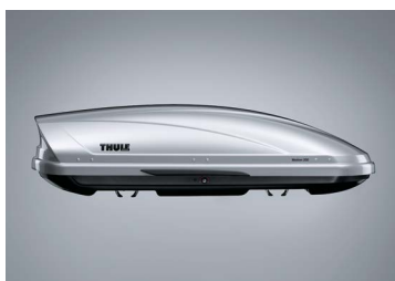
THULE MOTION 200 SILVER LUGGAGE POD 1