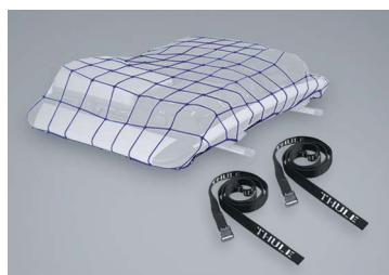
NET AND STRAPS FOR LUGGAGE RACK