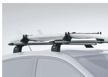
SURFBOARD CARRIER 1