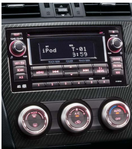
SINGLE IN-DASH CD PLAYER: SUBARU WRX