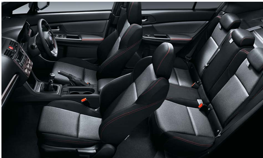
BLACK CLOTH: SUBARU WRX