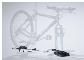
BICYCLE HOLDER 1 (FORK MOUNTED)