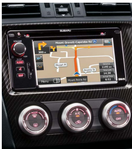
MULTI-INFORMATION IN-DASH SATELLITE NAVIGATION SYSTEM: SUBARU WRX PREMIUM