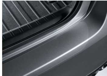
REAR BUMPER APPLIQUE