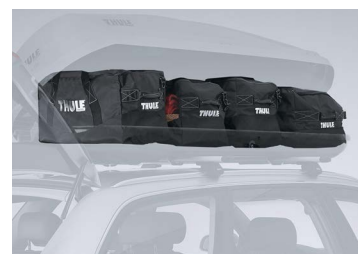
THULE GO PACK SET