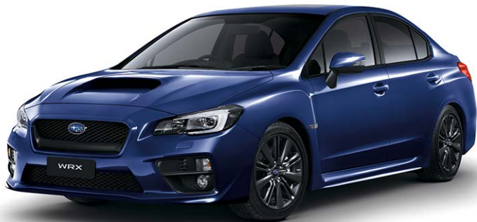
GALAXY BLUE SILICA