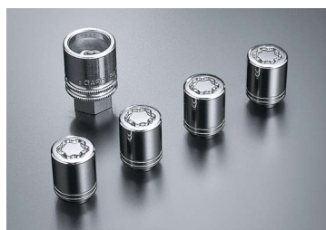
WHEEL LOCK NUTS